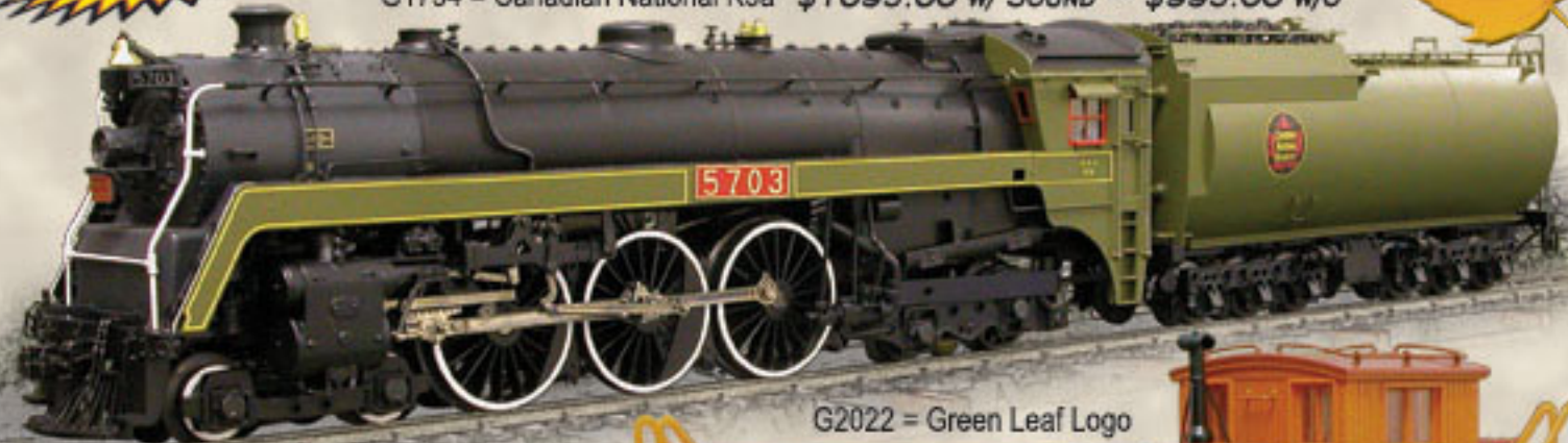
G2022 = Green Leaf Logo